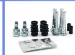
Brake Repair Kit