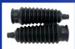
Steering Gear Boots