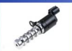
Oil Control Valve