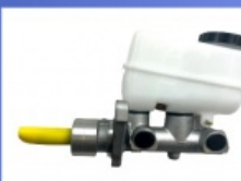
Brake Master Cylinder