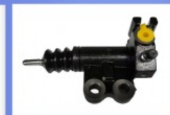
Brake Slave Cylinder