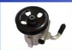
Power Steering Pump