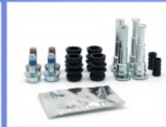
Brake Repair Kit