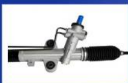
Power Steering Rack