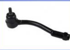
Tie Rod End