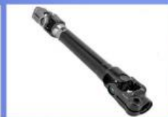
Steering Column Shaft